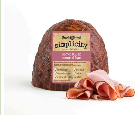
Boar's Head® Simplicity® All Natural* Brown Sugar Uncured Ham - deli