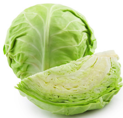
Organic Green Cabbage