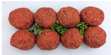
House Made Meatloaf & Meatballs