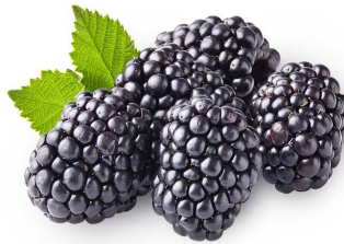
Organic Blackberries - 6 oz pkg