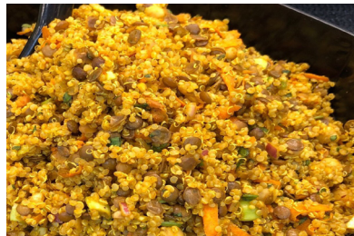
Organic Curried Lentil Quinoa - deli