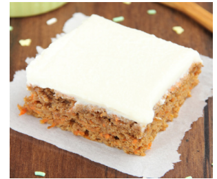
Organic Carrot Cake Bar