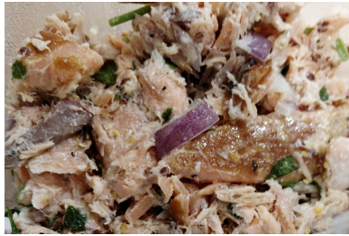
House Made Smoked Salmon Spread