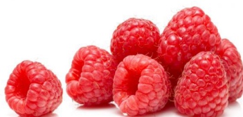
Organic Raspberries - 6 oz pkg