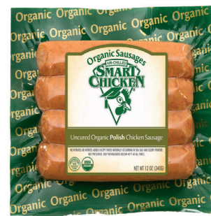
Assorted Smart Chicken Sausages - 12 oz pkg