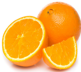
Organic Naval Oranges