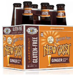
Lakefront Brewery 4/6/12 pks - all varieties