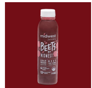
Midwest Juicery - all varieties