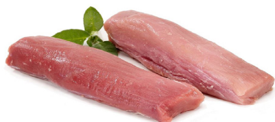
All Natural Trimmed Pork Tenderloin