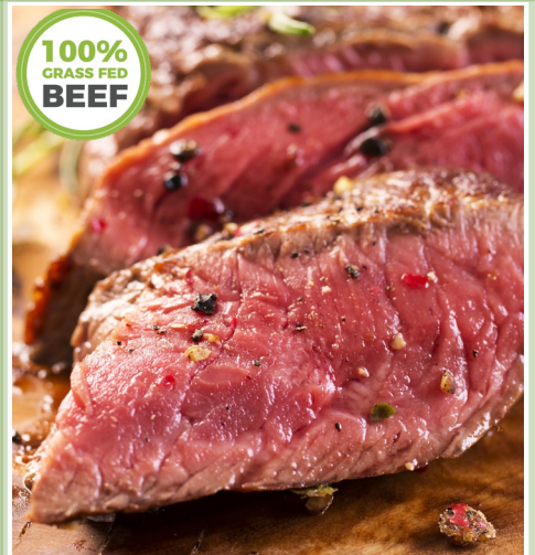
Grass Fed Boneless Ribeye Steaks