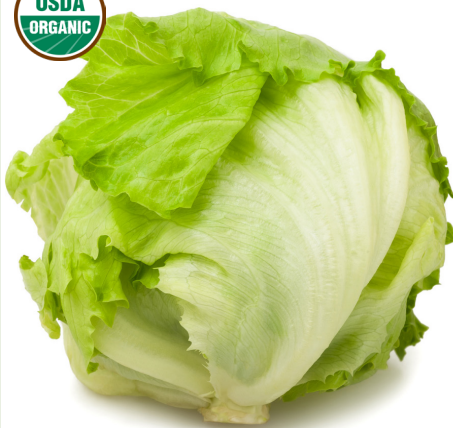
Organic Iceberg Lettuce