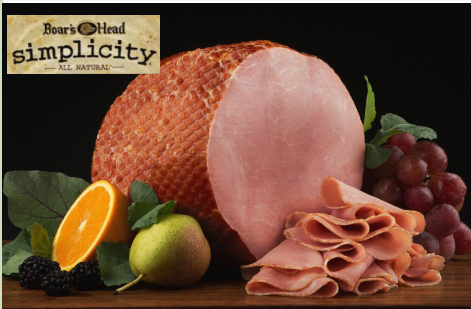
Simplicity All Natural Brown Sugar Uncured Ham