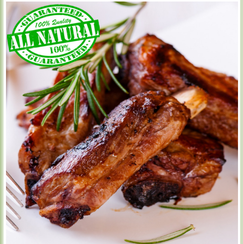
Pork Baby Back Ribs