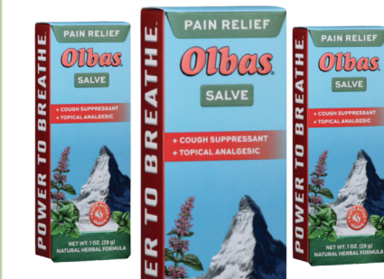
Olbas Pain Relief Salve - 1 oz