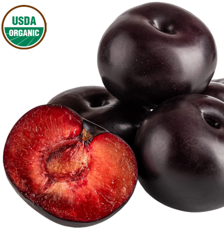
Organic Red & Black Plums