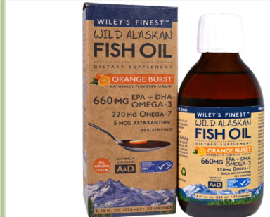
Wiley's Finest Fish Oil - orange burst, 8.45 fl oz