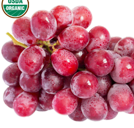
Organic Red Grapes