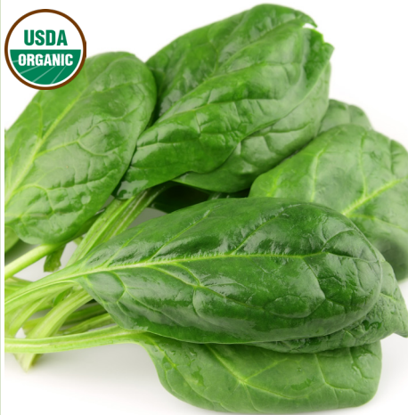
Organic Bunched Spinach