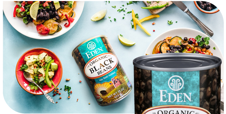
Eden Organic Beans (selected varieties)