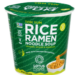
Lotus Foods Ramen Soup Cups (selected varieties)