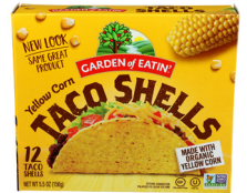
Garden of Eatin' Taco Shells