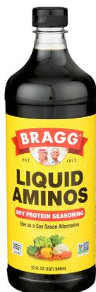
Bragg Liquid Aminos

Bragg is here to help you live more vibrantly, every day. With an ever-expanding portfolio of ingredient-led products backed by a century of time-tested wisdom, Bragg remains passionately focused on helping each individual eat better, feel better, and enjoy a more healthful and vibrant life.