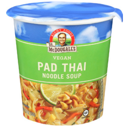
Dr. McDougall's Soup Cup (selected varieties)