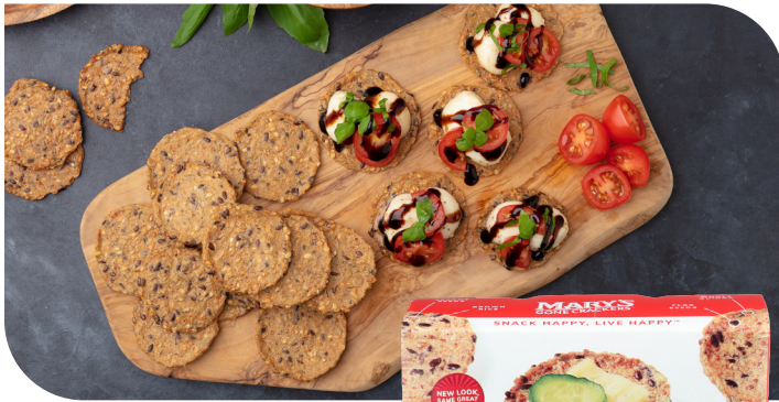
Mary's Gone Crackers Organic Crackers (selected varieties)

"Happily we bask in this warm September sun, which illuminates all creatures." -Henry David Thoreau