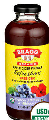
Bragg Organic Apple Cider Vinegar Refreshers (selected varieties)