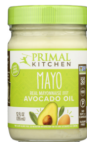
Primal Kitchen Mayo with Avocado Oil