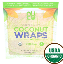
NUCO Organic Coconut Wraps (selected varieties)