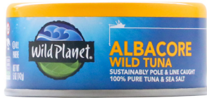
Wild Planet Albacore Wild Tuna (selected varieties)

This school year make lunch easier with Wild Planet's sustainably caught seafood. We selectively harvest our seafood in way that respects our oceans and is delicious, nutritious, and satisfying. Taste the delicious Wild Planet difference.