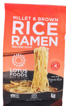
Lotus Foods Rice Ramen (selected varieties)

For 26 years as a family-owned Certified B Corp company, Lotus Foods has reflected the mission to change how rice is grown on our planet – from looking out for the farmers' well-being, to protecting our environment, and for producing trustworthy, organic, gluten-free products that taste great.