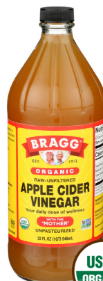
Bragg Organic Apple Cider Vinegar