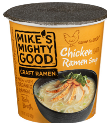
Mike's Mighty Good Craft Ramen (selected varieties)