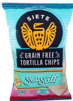
Siete Tortilla Chips (selected varieties)