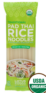
Lotus Foods Organic Rice Noodles (selected varieties)