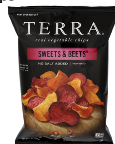
Terra Chips Sweet Potato Chips (selected varieties)