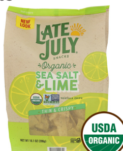
Late July Organic Tortilla Chips (selected varieties)