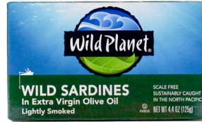
Wild Planet Wild Sardines (selected varieties)