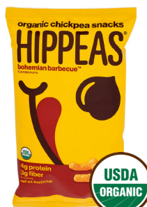
Hippeas Organic Chickpea Puffs (selected varieties)