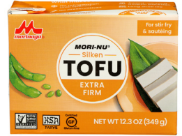
Mori-Nu Silken Tofu (selected varieties)